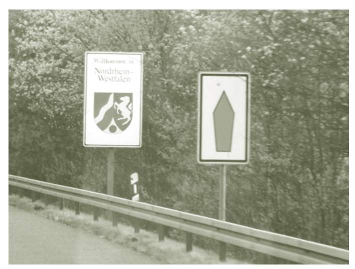
Figure 10. Example of permanent diversion route symbol sign.