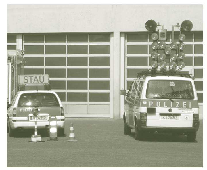
Figure 9. German end-of-queue warning vehicles.

The team found widespread use of preplanned diversion routes on the motorways in several countries. These diversion routes are identified with symbols on permanent signing, so when a diversion route is put into effect, motorists need only to be told to follow a particular symbol. This reduces the effort needed for traffic control near the scene of a major incident. Figure 10 illustrates a diversion route symbol on a roadway. The team offers the following recommendation on preplanned diversion routes.