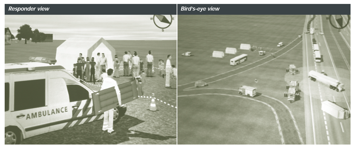
Figure 4. Images from virtual training example.

Based on the examples of integrated training activities observed in the host countries, the team believes that significant value would be realized from better integrating traffic incident response into first responder training. Accordingly, the team recommends the following.