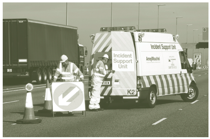
Figure 2. AmeyMouchel incident support unit.

The team found that emergency medical services appear to be provided at a level comparable to or higher than the paramedic level found in the United States and are highly coordinated with police, fire, and major incident responders. All of the countries visited have highly evolved helicopter EMS systems. England and Germany use highly trained emergency medical technicians or paramedics. In Germany, these are supplemented by physicians who respond to most scenes and provide most of the advanced life support. In the Netherlands, highly specialized nurses provide most of the advanced life support ambulance care, occasionally supple-