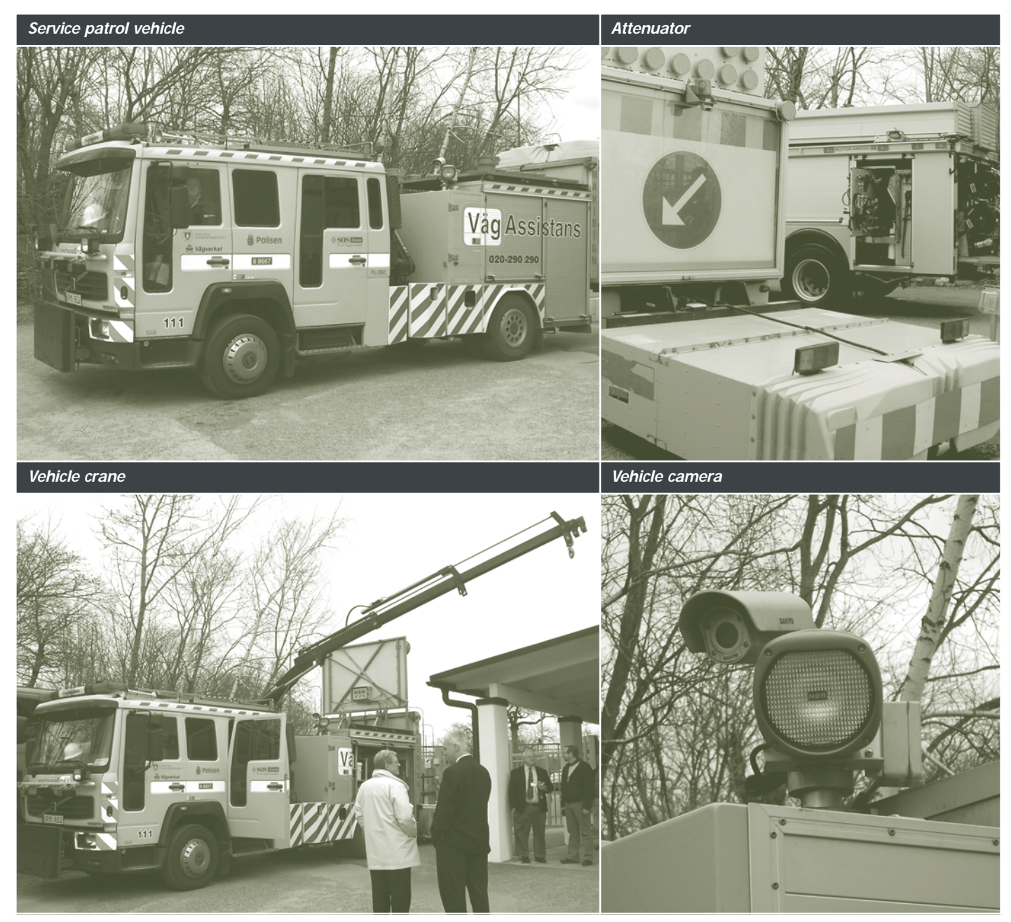
Figure 12. Swedish road service patrol vehicle.

is mounted in the passenger compartment with an easy roll-off, roll-on ramp. EMS personnel said that 90 percent of their emergency patients are transported on this chair rather than on a cot.