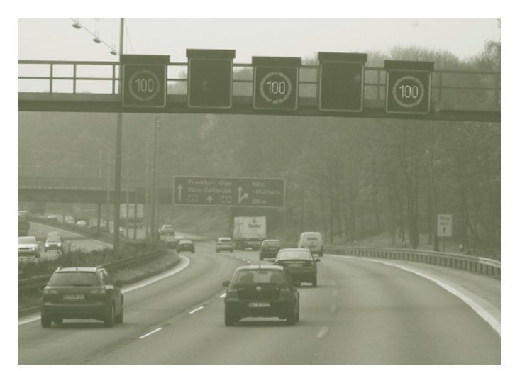
Figure 11. Example of variable speed limit in Germany

As previous scanning teams had observed in Europe, the team found the use of variable speed limits an effective means of controlling traffic upstream of an incident site. On motorways in England, Germany, and the Netherlands, overhead gantries at regular intervals have a variable message sign above each lane capable of displaying a speed limit for that lane. Figure 11 illustrates one of