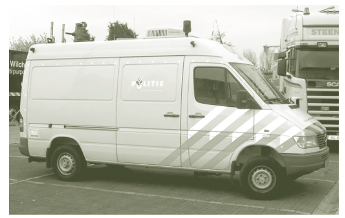
Figure 8. Retroreflective dots used to define vehicle shape.

location where official vehicles could pick them up and transport them to the incident scene.