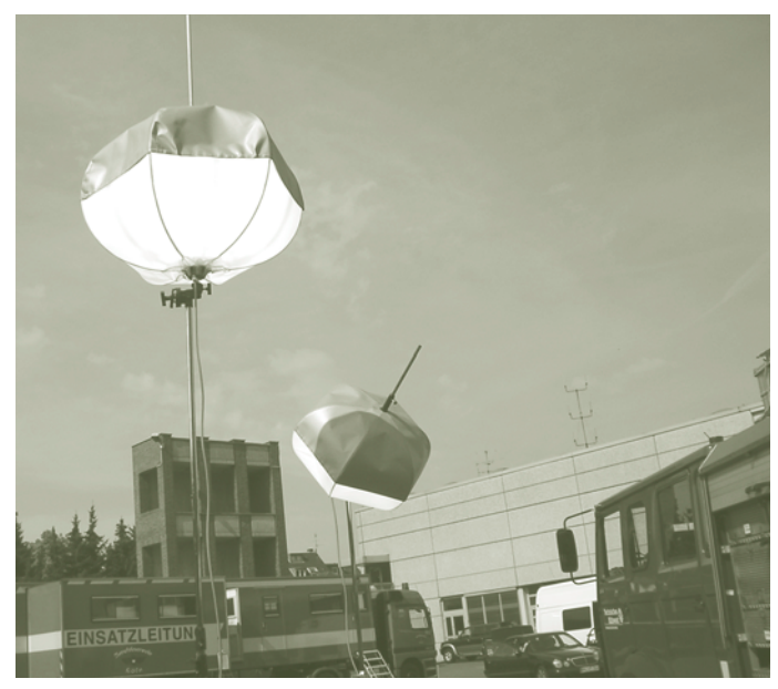
Figure 14. Powermoon lighting system.

A portable lighting unit, called Powermoon<sup>®</sup> (shown in figure 14), is used at nighttime incidents to provide scene lighting in a manner that reduces the glare for approaching vehicles.