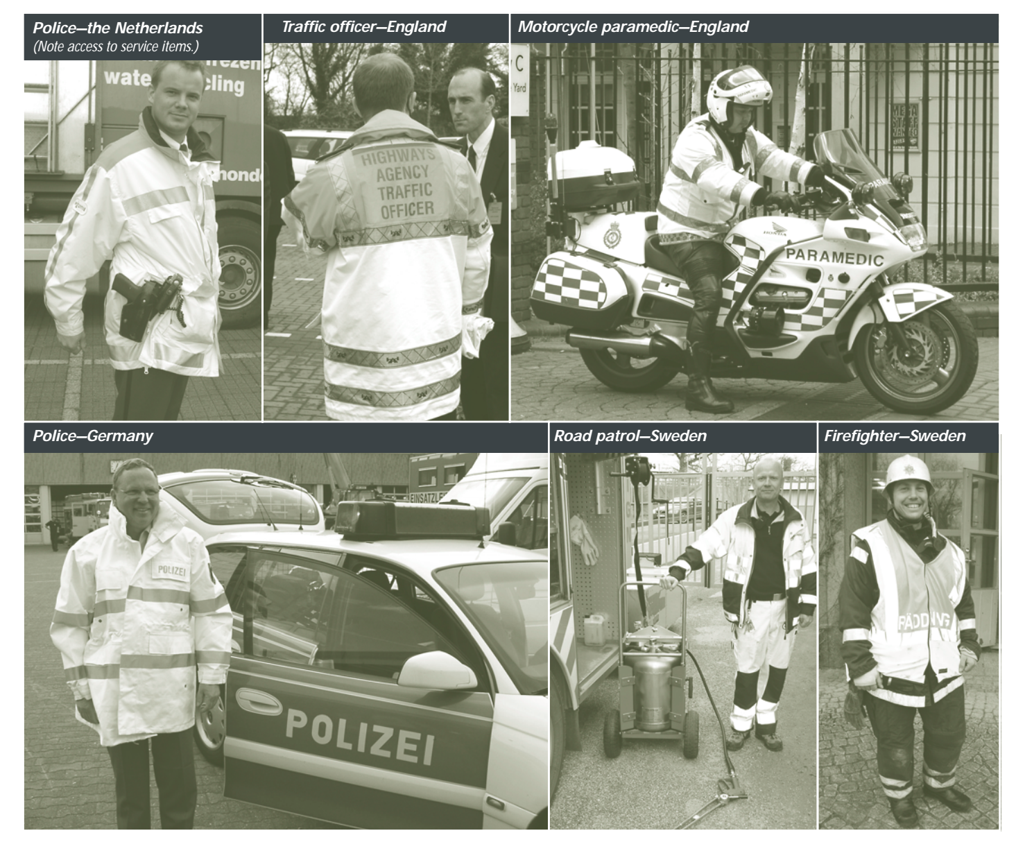
Figure 6. Examples of high-visibility garments for responders.