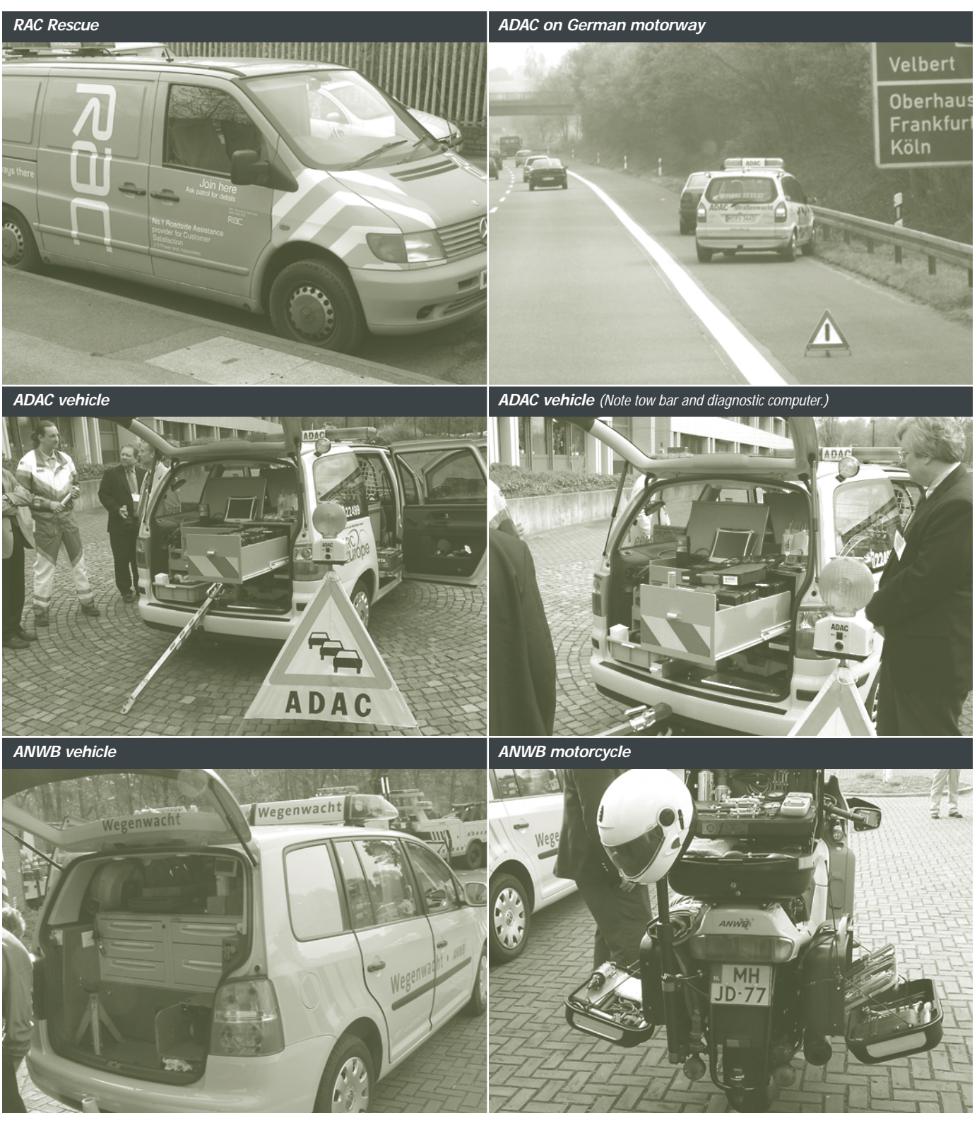
Figure 5. Auto club service vehicles.