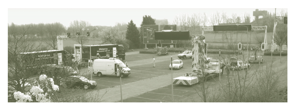
Figure 3. Research and demonstration facility in the Netherlands.

mented by physicians in the field. In Sweden, a mix of nurses and emergency medical technicians and paramedics is employed.