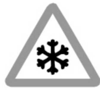
Examples of symbols used on variable message signs.

The first is intelligent speed adaption, a technology that alerts a driver (with an audible in-car alarm) when he or she is exceeding the posted