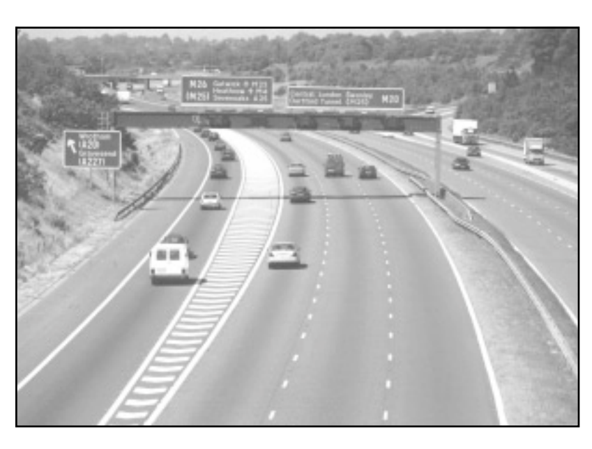
Tiger rail pavement markings on entrance ramp to freeway in England.

The team members classified their key findings into five categories: traffic control devices, freeway control, operational practices, information management, and administrative practices.