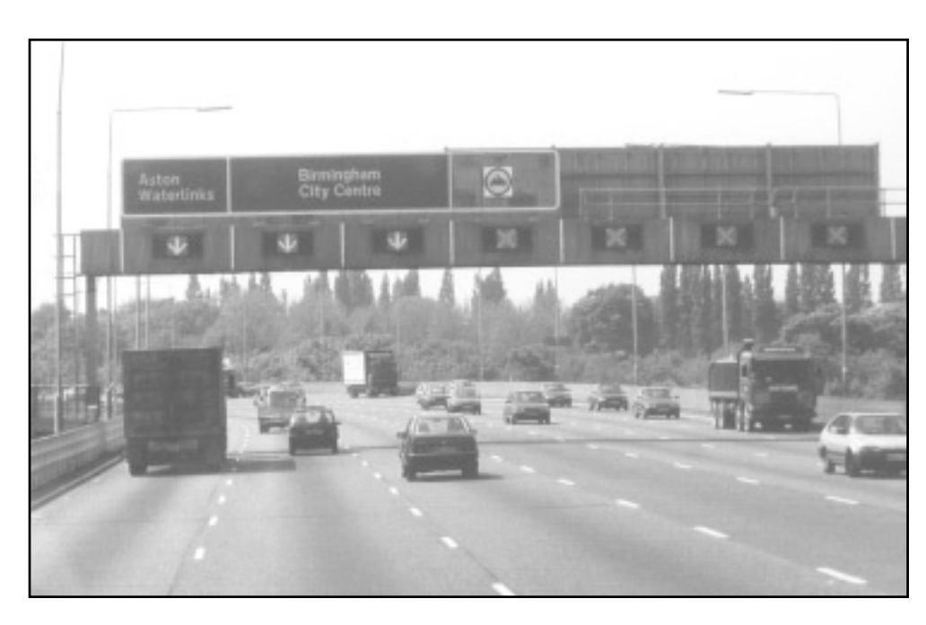
Lane control signals on freeway in England.

Lane control signals are also widely used on European freeways. These signals, mounted over each lane, typically use a red X, a green arrow, or a